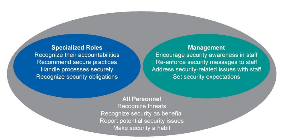
Figure 1: Security Awareness Roles for Organizations

The first task when scoping a role-based security awareness program is to group individuals according to their roles (job functions) within the organization. A simplified concept of this is shown in Figure 1 on the following page.